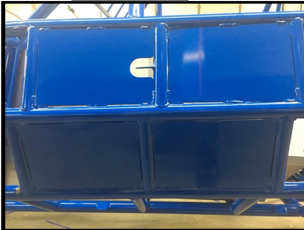
W1. EXTERIOR VIEW