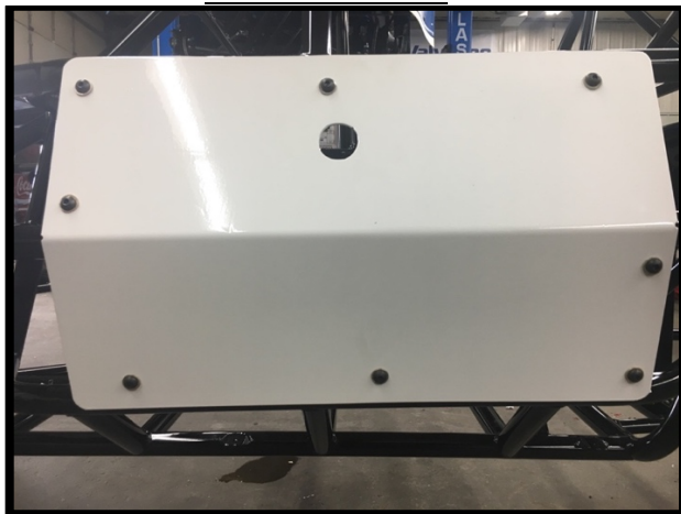
T1. EXTERIOR VIEW